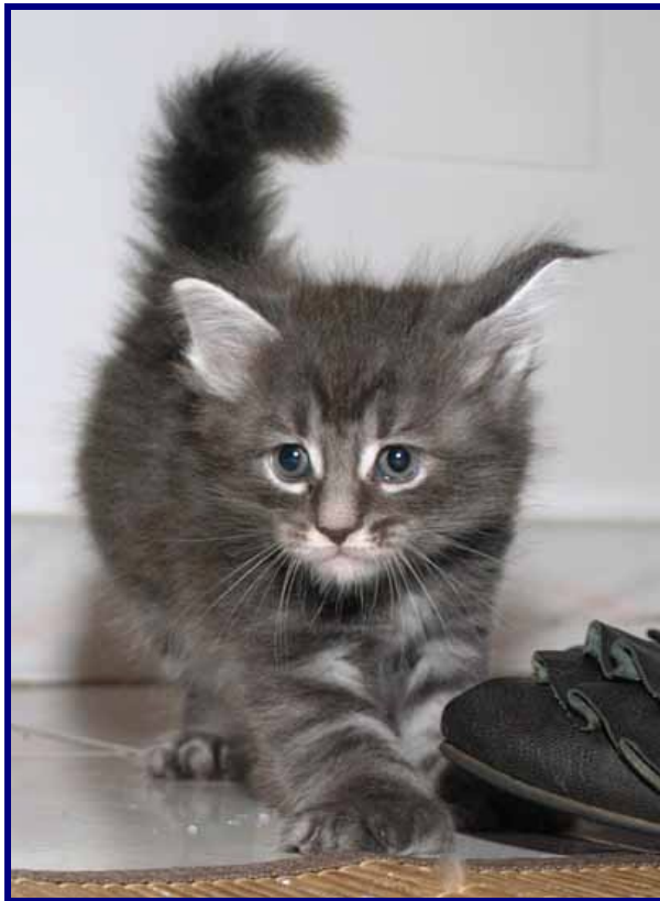
Kreiz Ar Mor Dougall Dylan P of Anatolê Main Coons