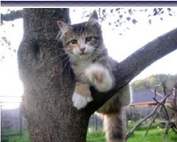
WaterCoons Thundergirl P