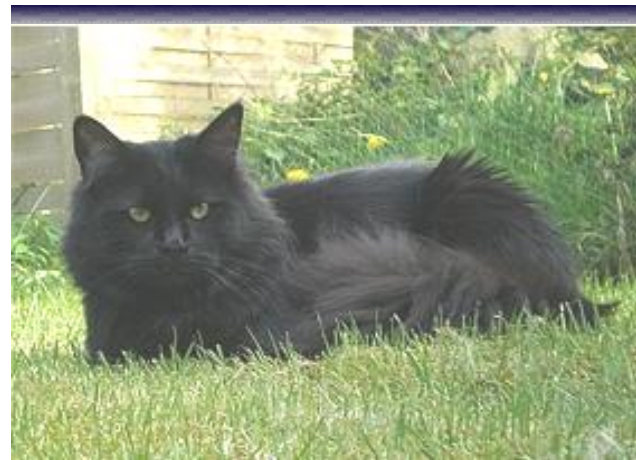
WaterCoons Nighthawk P In The Air of DemiCoons